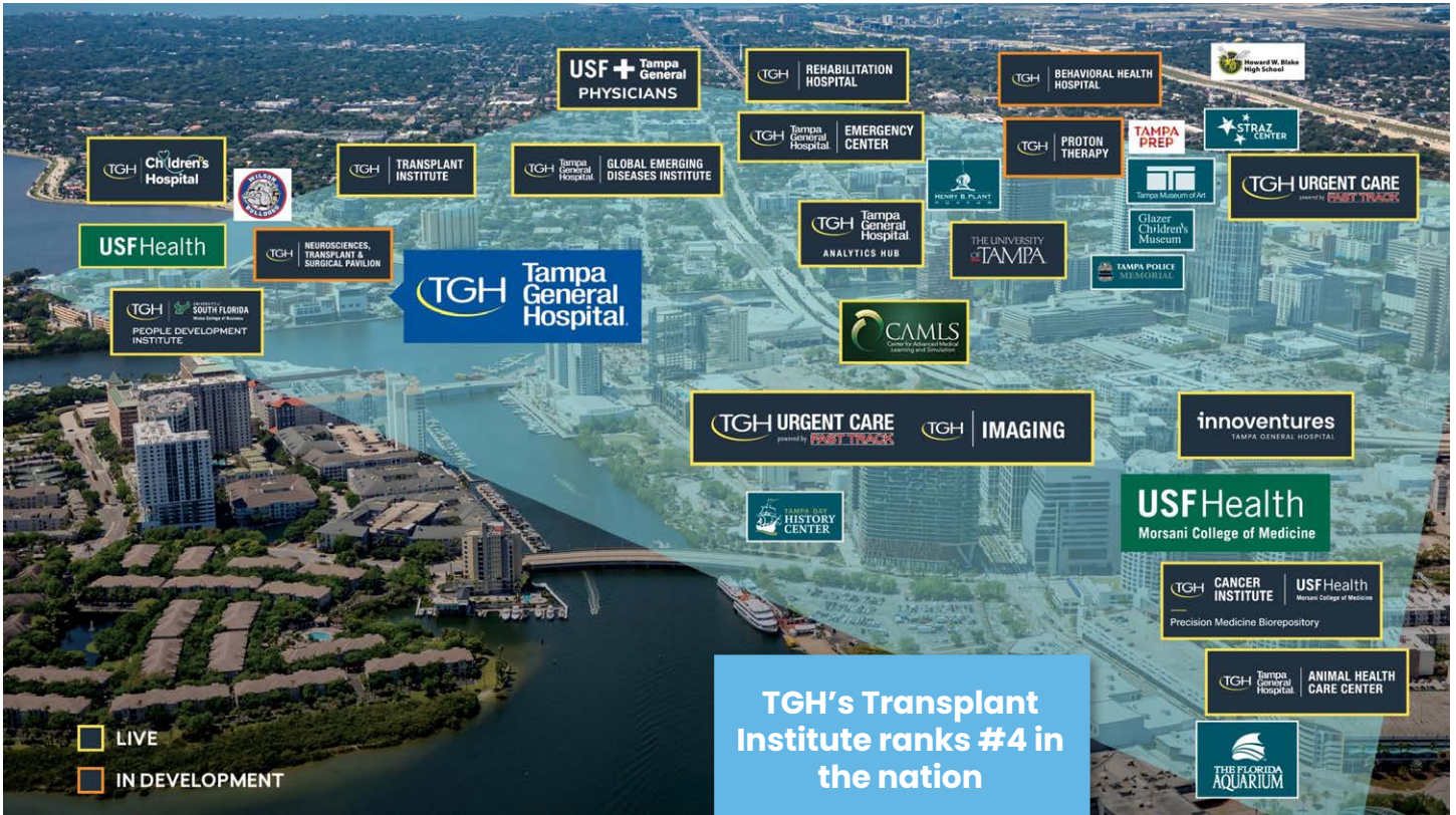
Tampa Medical and Research District map